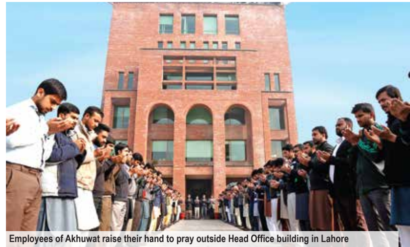
Employees of Akhuwat raise their hand to pray outside Head Office building in Lahore

Musharaka is a mode of Islamic financing in which capital is provided by two or more parties for project development. Akhuwat, in collaboration with Oxford University and Lahore University of Management Sciences (LUMS), is developing a tri-partite relationship to form the Musharaka Project.