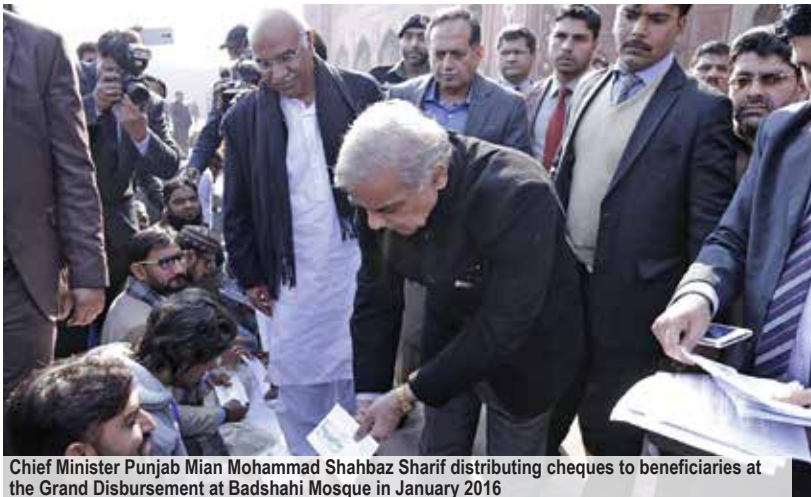
Chief Minister Punjab Mian Mohammad Shahbaz Sharif distributing cheques to beneficiaries at the Grand Disbursement at Badshahi Mosque in January 2016

The Akhuwat Model has been replicated by a number of public and private sector organizations. The Government of Punjab initiated its flagship program titled the “Chief Minister Self Employment Scheme” followed by “Prime Minister Interest Free Loans Scheme” which aimed to target the most underprivileged segment of society. Similarly, the Government of Gilgit Baltistan also initiated the Chief Minister Employment Scheme in GB, along with the Government of Khyber Pakhtunkhwa, which has adopted the same model for the Federally Administered Tribal Areas (FATA). All these initiatives follow “interest free microfinance” model conceived and developed by Akhuwat. Technical Education and Vocational Training Authority (TEVTA) is yet another addition to provide financial access to its graduates through Akhuwat.