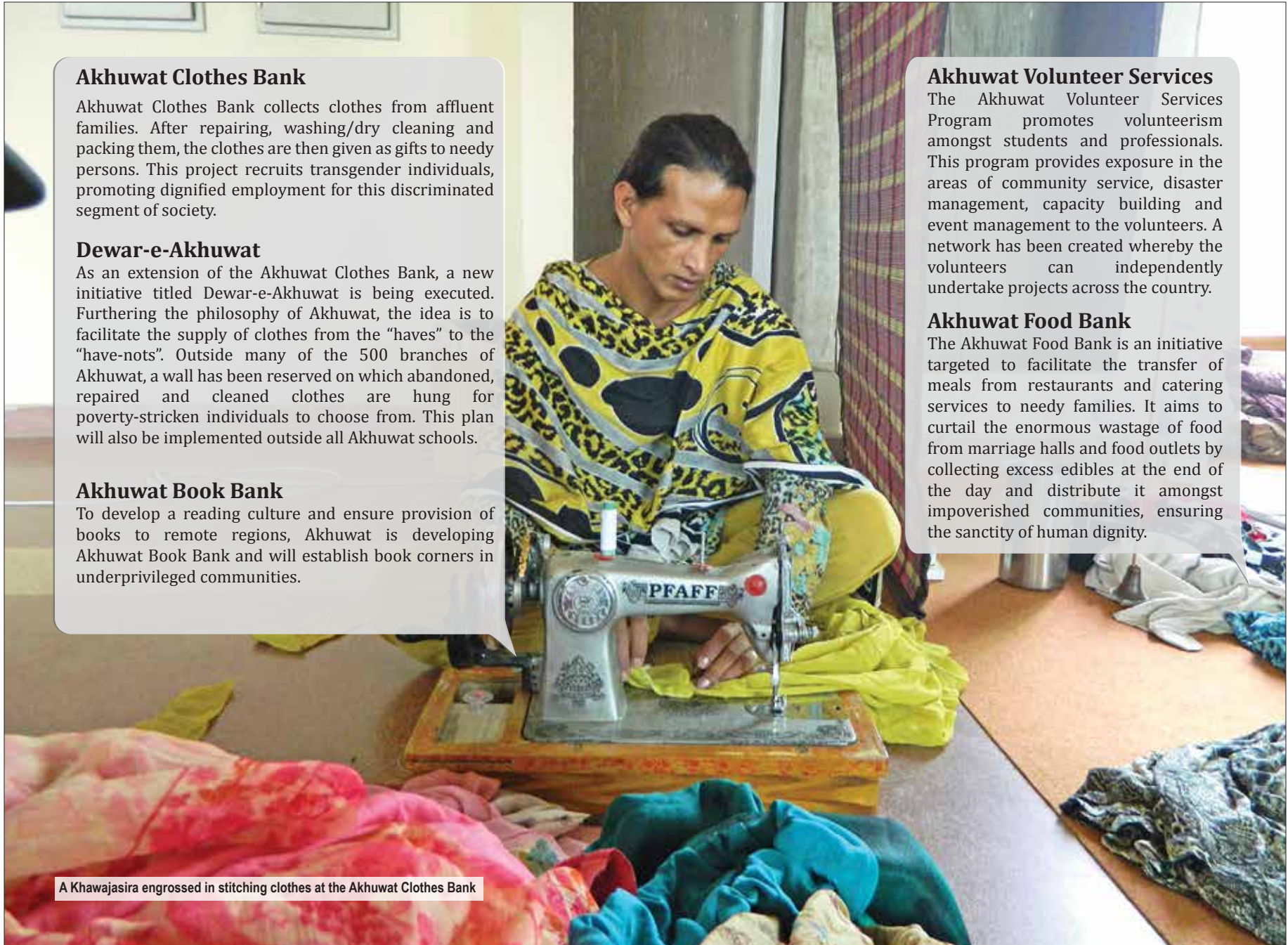
A Khawajasira engrossed in stitching clothes at the Akhuwat Clothes Bank

The Akhuwat Food Bank is an initiative targeted to facilitate the transfer of meals from restaurants and catering services to needy families. It aims to curtail the enormous wastage of food from marriage halls and food outlets by collecting excess edibles at the end of the day and distribute it amongst impoverished communities, ensuring the sanctity of human dignity.